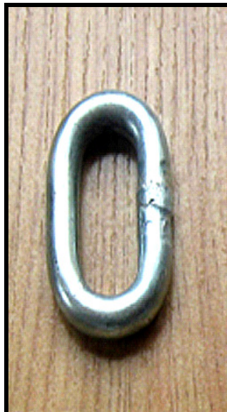
The simple chain link