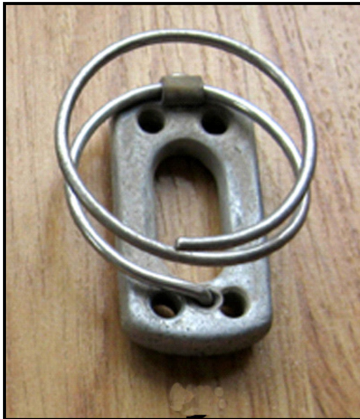
The first spring