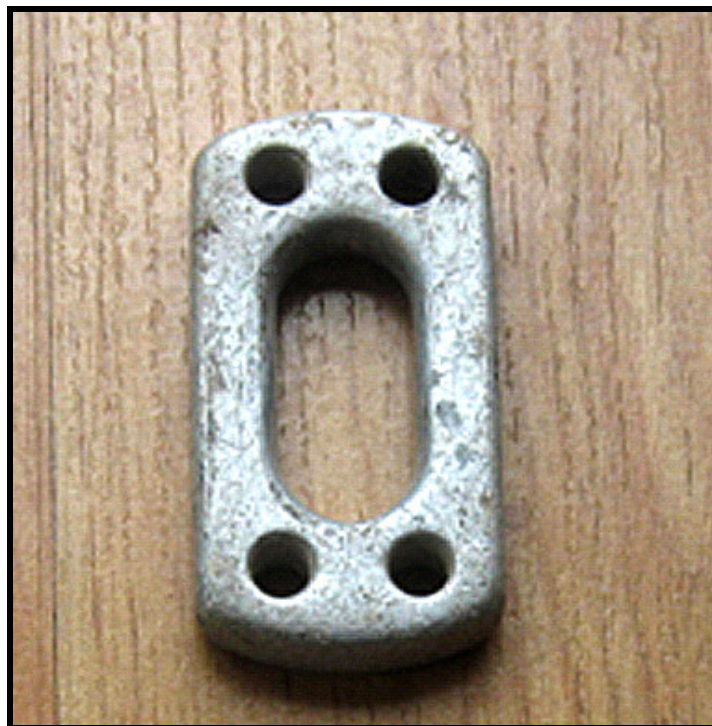
The first alloy Sticht Plate

We never thought anymore about it until the following year when Mr. P again paid me another visit. This time the device had been improved from a simple link of a chain to a shaped piece of alloy