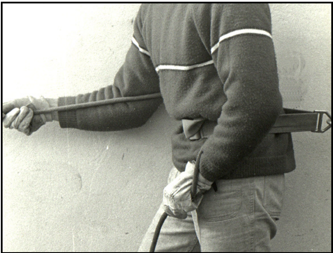
The waist belay with simple waist belt

There have been many inventions and pieces of equipment that one can think of that has advanced climbing during the past years, from the first piece of rock (chock stone) placed as protection to the modern Camming Devices. One of the most significant and often overlooked, by new comers to the sport, are the belaying friction devices which we use so freely to protect our leaders and seconds. The choices now in the shops are astonishing. It was not that far back, the mid 70s, that everyone was 'body belaying'.